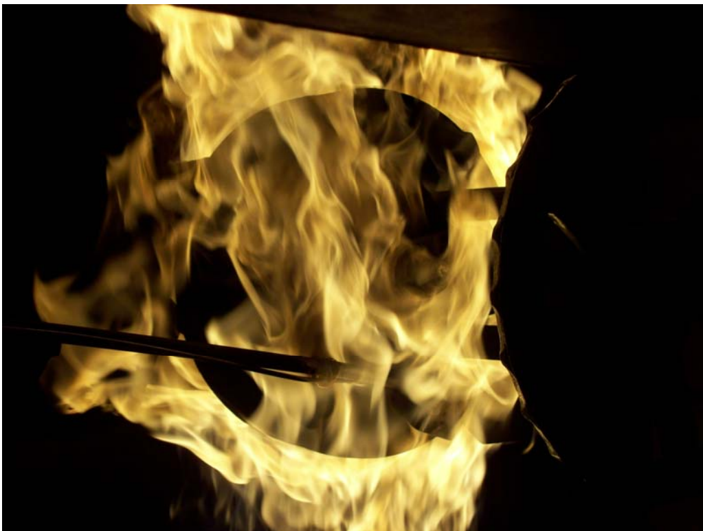
Valve During Burn.