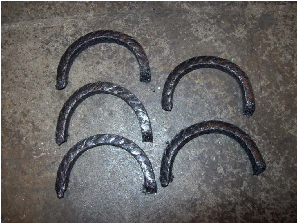
Packing Prior to Test